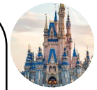
Magic Kingdom & Animal Kingdom